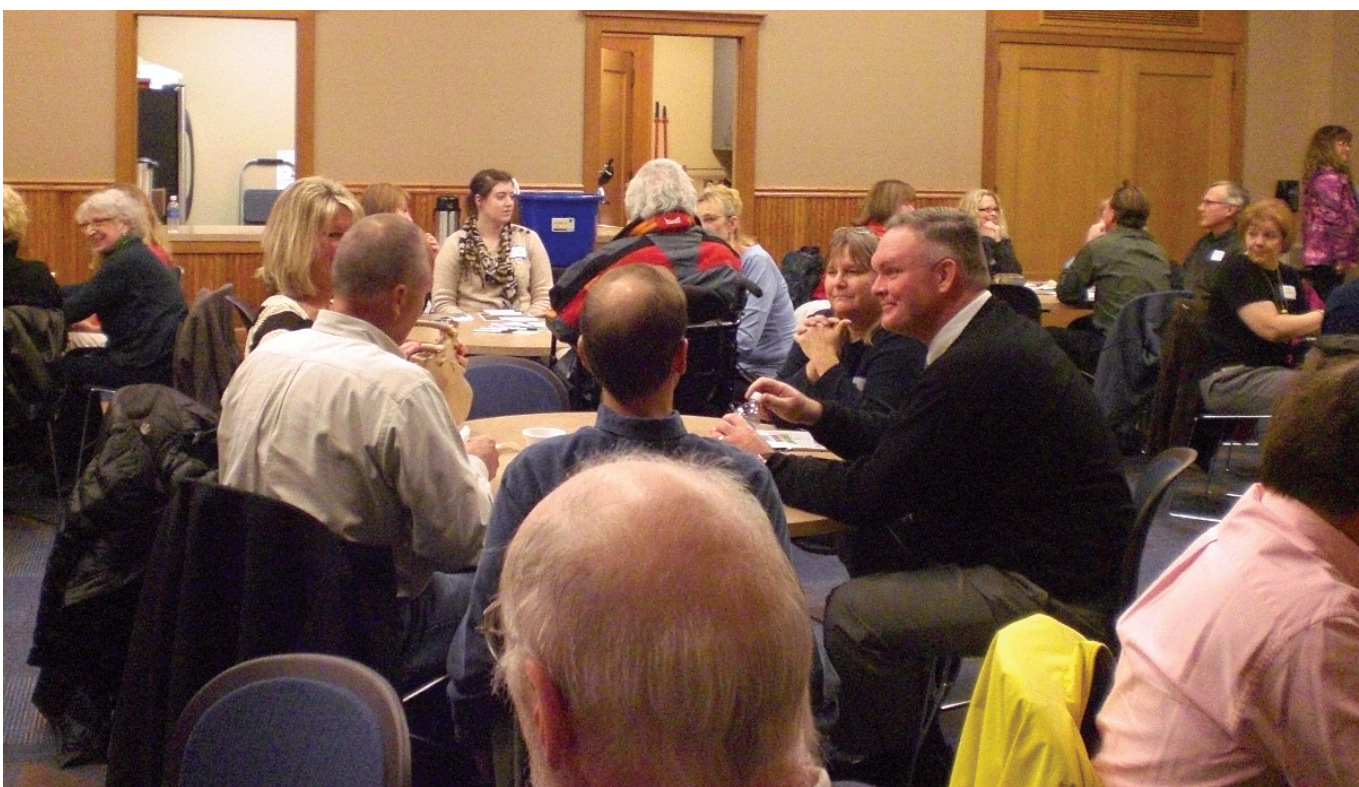
Locals gather at the Charlevoix Est Dyanimique Visioning Forum to brainstorm economic growth in the area.

"You need to have teamwork to make success. We are starting good positive momentum to make changes and creating a positive atmosphere for business growth," Pearson