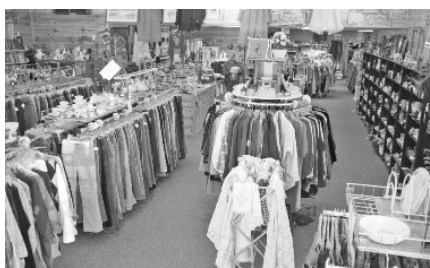
With approximately 4,000 square feet of fully stocked resale space, and new inventory arriving daily, customers can shop for just about anything starting with any letter in the alphabet at A-2-Z Resale in Gaylord.