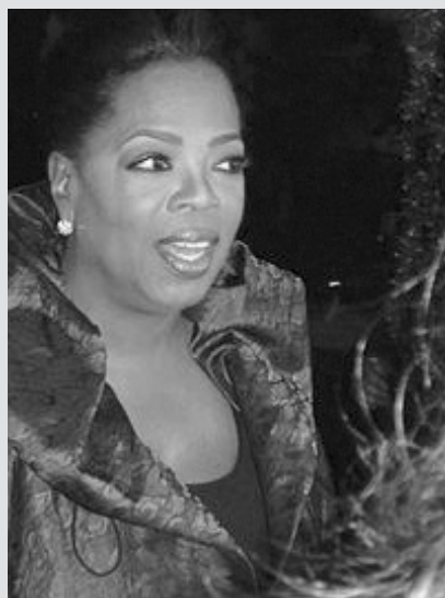
Oprah Winfrey, Jim Carrey, and Will Smith are some of the celebrities who credit The Law of Attraction as important to their success.

According to the Law of Attraction, you attract what you believe. There is probably a constant stream of thoughts in your mind. They can be negative thoughts about yourself or your situation. Negative thoughts will bring about more negative thoughts and lead to negative events. What you are thinking becomes real. Ever notice how some