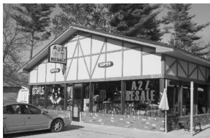
A-2-Z Resale is located at 1829 Old 27 South (S. Otsego Avenue) in Gaylord. The store is open from 9 am to 6 pm, seven days a week all year long with the exception of holidays.

way to update your wardrobe or get decked-out for that upcoming special